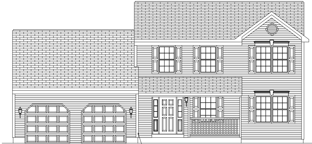
FRONT ELEVATION FORINO - DENVER II - 4BR - STANDARD CLASSIC 2412 SQ. FT.