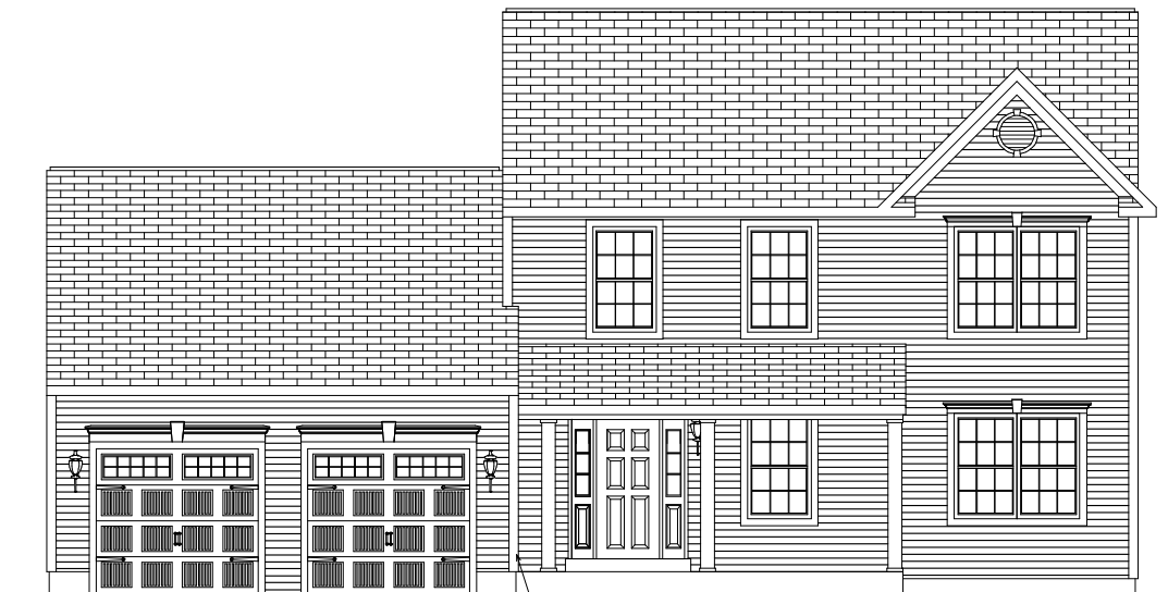
FRONT ELEVATION FORINO - DENVER II - 4BR - OPTION "A" 2412 SQ. FT.