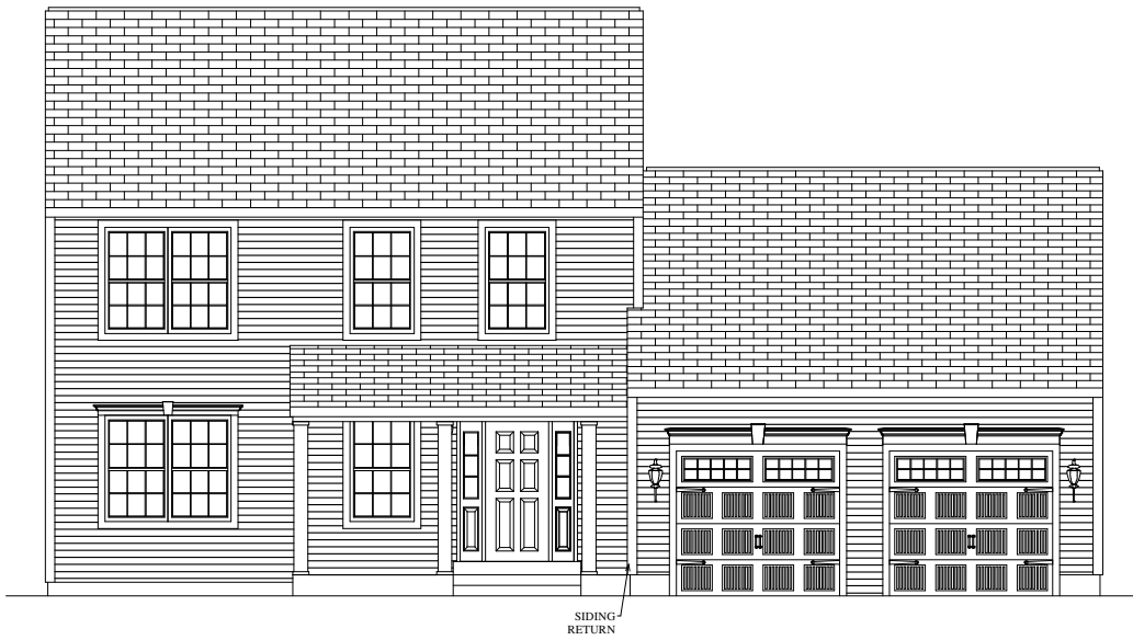
FRONT ELEVATION FORINO - DENVER I - 4BR - OPTION "A" 2292 SQ. FT.