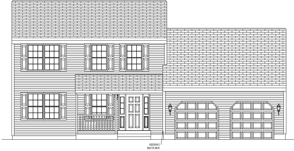
FRONT ELEVATION FORINO - DENVER I - 4BR - STANDARD CLASSIC 2292 SQ. FT.