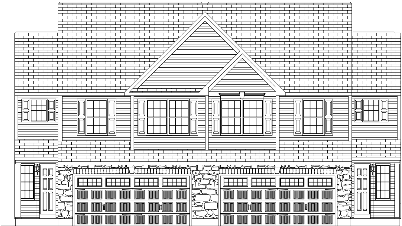
FRONT ELEVATION FORINO - DURHAM TOWNHOUSE - CLASSIC - 1617 SQ.FT.