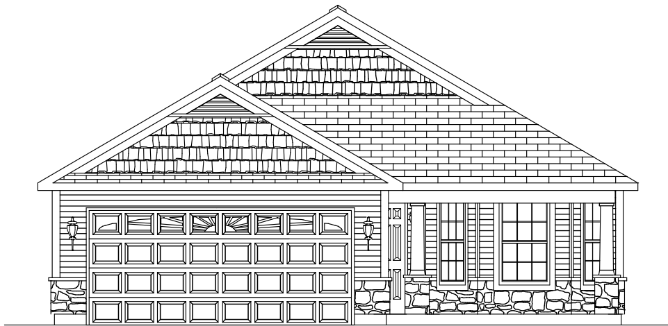
FRONT ELEVATION FORINO - THE CATAWBA (S.C. #13) 1530 SQ.FT.