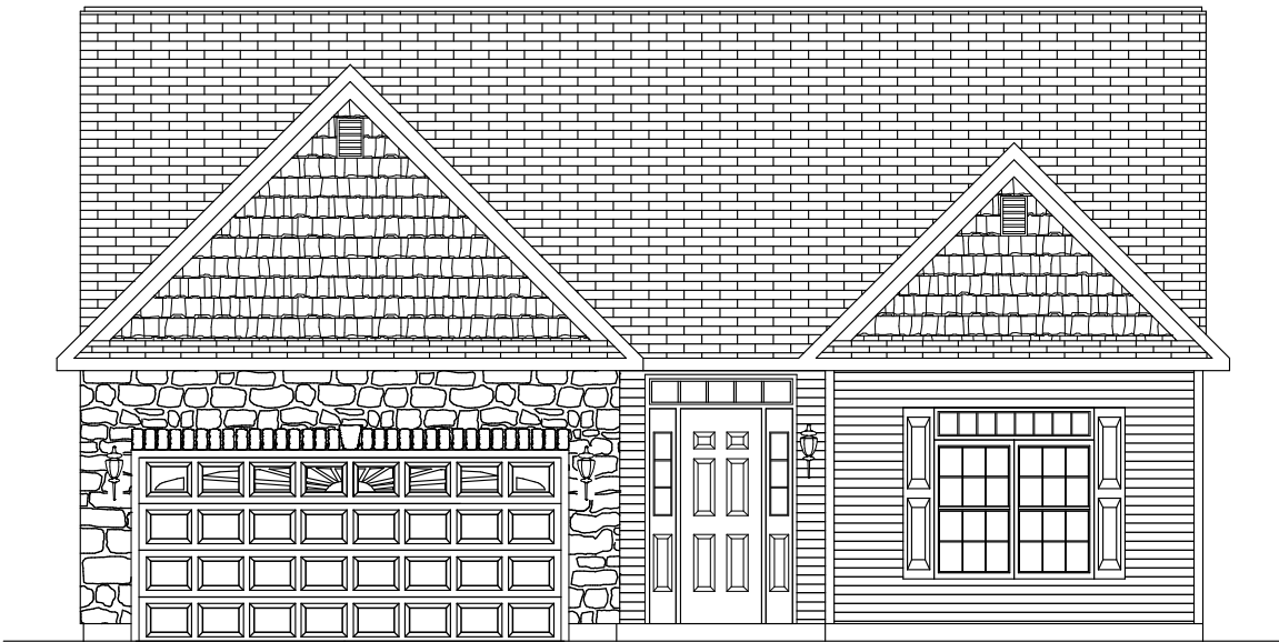
FRONT ELEVATION FORINO - THE ASHLEY (S.C. #1) 1855 SQ.FT.