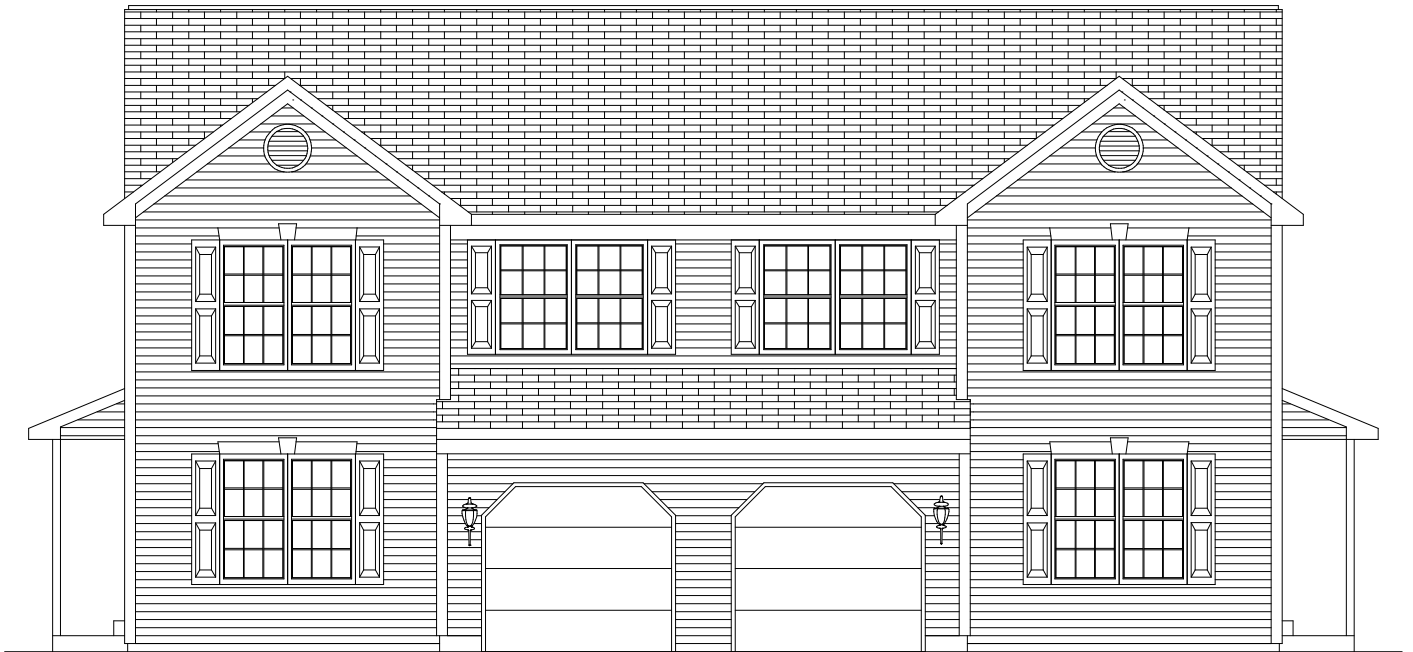
FRONT ELEVATION FORINO - CAROLINA DUPLEX - CLASSIC 1773 SQ. FT. (EACH UNIT)