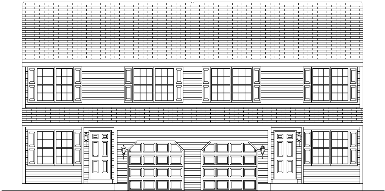
FRONT ELEVATION FORINO - CHARLOTTE DUPLEX - CLASSIC 1525 SQ. FT. (EACH UNIT)