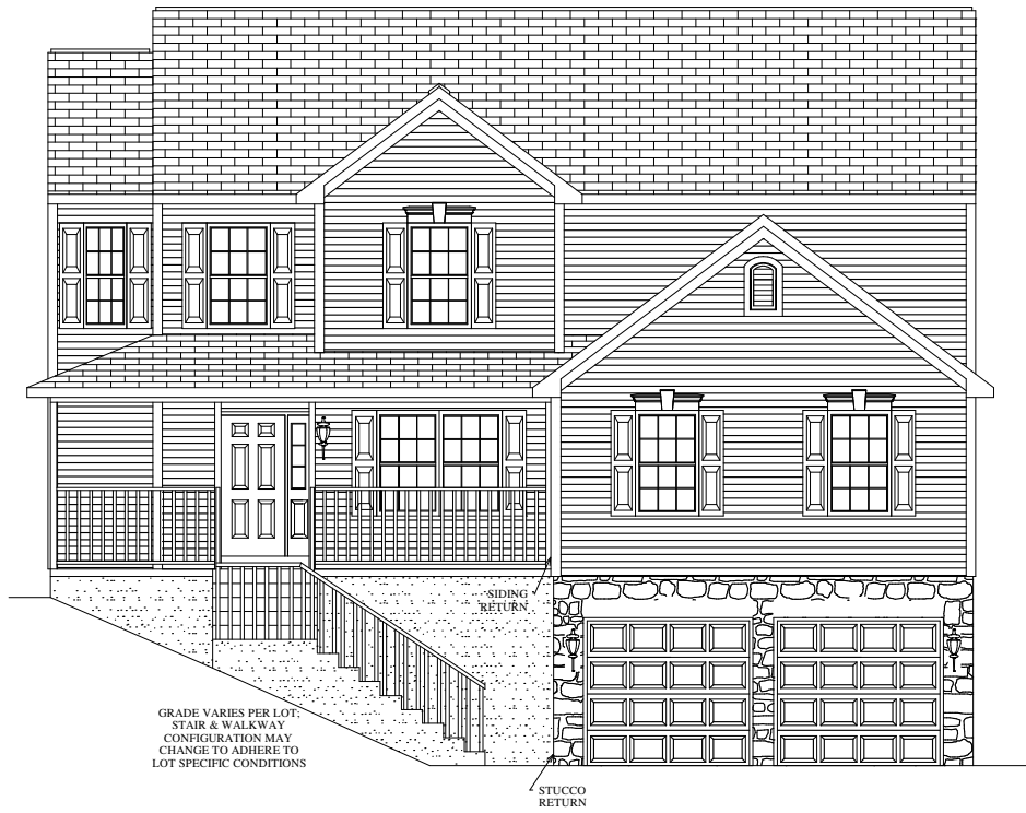
FRONT ELEVATION FORINO - SAN DIEGO - BASEMENT ENTRY - STANDARD CLASSIC 2646 SQ.FT.