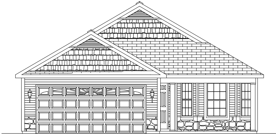
FRONT ELEVATIONS FORINO - WILLIAMSBURG I (SLAB) - CLASSIC 1530 SQ.FT.