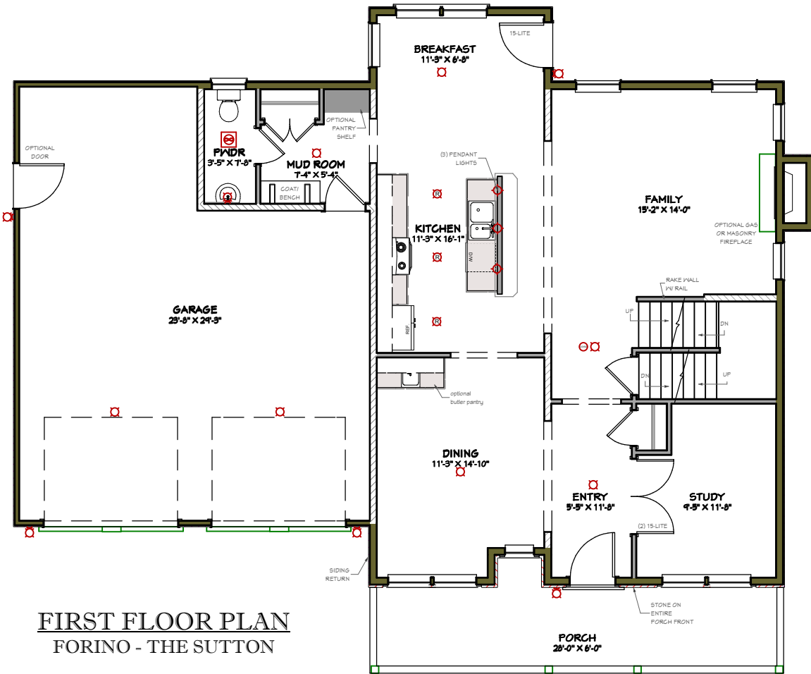
FIRST FLOOR PLAN FORINO - THE SUTTON