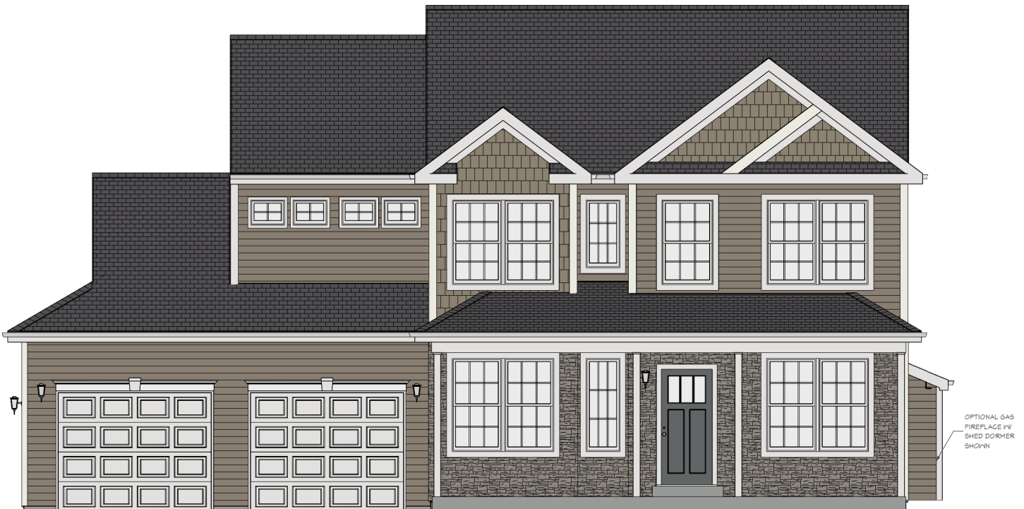
FRONT ELEVATION FORINO - SUTTON - TRADITIONAL 9' FIRST FLOOR WALL HEIGHT 2345 SQ. FT.

Elevations and landscaping are artist conceptions only. Blueprints and contracts take precedence over artwork. Room sizes are approximate and subject to field variations.