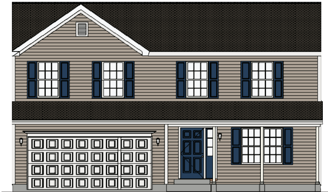
FRONT ELEVATION FORINO - ANDREW - II - TRADITIONAL 8' FIRST FLOOR WALL HEIGHT 2071 SQ. FT.

Elevations and landscaping are artist conceptions only. Blueprints and contracts take precedence over artwork. Room sizes are approximate and subject to field variations.